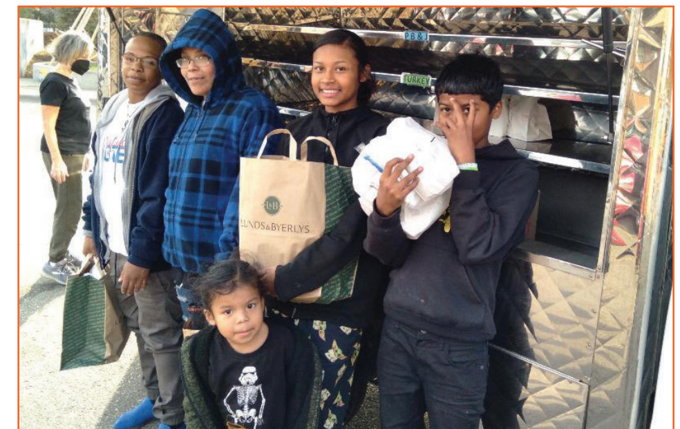
Our Mobile Loaves truck delivers meals to our grateful friends in need